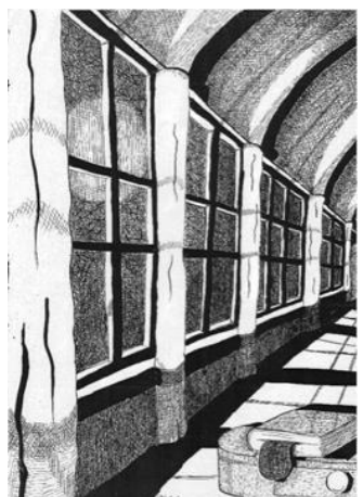
Corridor, ink, 2002