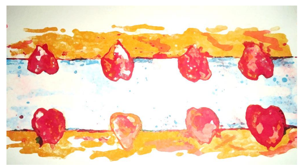
Hard, heard, hurt, lithography, 2017

However, as you will see, representations of the same themes in a colorful palette make Peeter's pandemic paintings, unexpectedly