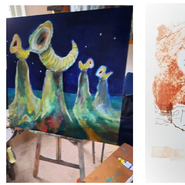
Horns of plenty, oil, 2020

Our broken links are echoed by an installation in the righthand main staircase. You will see a hanging metal chain that connects beginning and end of the exhibition. The chain holds, even though it is broken. Also, the lithography on the front of this catalogue is inspired by the connections that we seem to have lost during 2020.