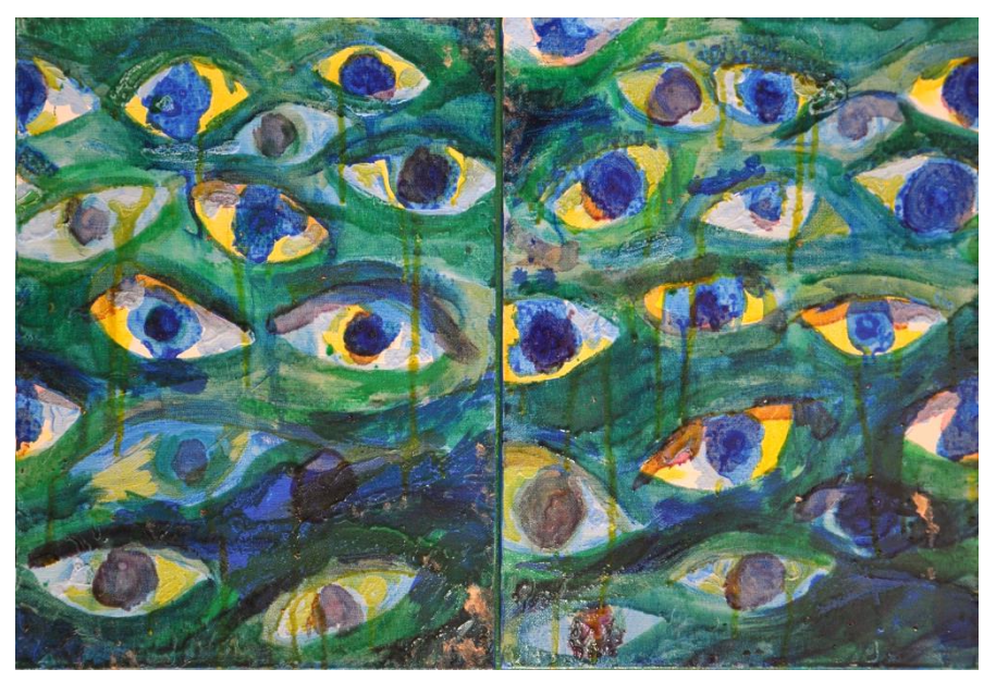
I sea, diptych, oil on canvas 2012

created links is also reflected in new titles for existing works of art and honors the dynamism and entrepreneurship during the first wave of the pandemic that led in a Schumpeterian sense to new ways to combine products, technology and delivery in academic teaching and research. Indeed, you will find the four-panel Neue Kombinationen on the first floor and you can alter the sequence of the paintings yourself!