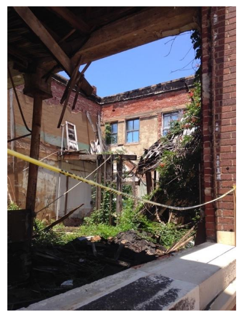
Main St., Boomtown, TX. June 2017.

Two months after my first visit to Boomtown, one of the larger buildings on Main Street caved in and collapsed. Through the broken windows, a large pool of snapped cement, corroded wood, and old electrical wires capped the trees and weeds growing up through the cracks in the concrete floor.