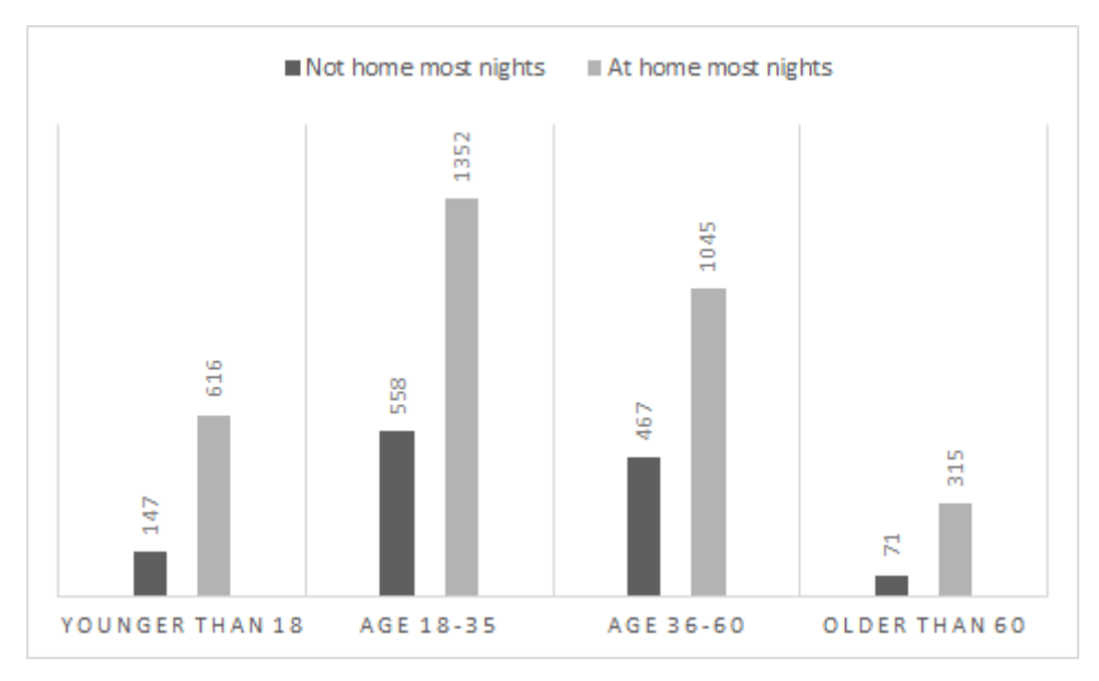
Graph 1: Age Category of Farm Dwellers Home Most Nights

Centripetal forces also operate to draw farm dwellers back to the farm in migration patterns often described as circulatory. A perhaps surprising feature of the data is the high preponderance of young adults who are on the farm. As Table 6 below shows, 71% of young adults between the ages of 18 and 35 stay at home most nights. Although most of the people leaving farms for work elsewhere are young men in this age group, the size of this age group on farms together with the high proportion who have no income from any source suggests that this is the most vulnerable sub-group in the agricultural precariat, and that residence on farms is the best of their a very limited range of options for living.