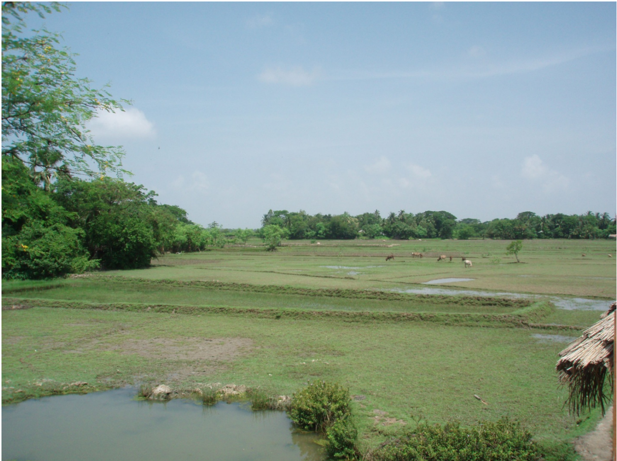
Figure 4: Interior of Polder 22

Polder 22 as well as those who live outside are acutely aware of both the pleasant aesthetics of this landscape, as well as the wide-ranging benefits it affords its residents. Highest among the list of benefits offered by this fertile environment free of shrimp farms is the ability to produce and consume one's own food and other household requirements. This collective understanding of food sovereignty as an ideal is expressed by individuals in Polder 22 from across the class spectrum. To that end, residents of Polder 22 repeatedly articulate the importance of their capacity to produce and consume without participating in the market. One landless woman explained, "even if I don't have money now to go to the market, I can make do. But if they [in the shrimp areas] don't have money in their hands, they have no way to survive. But we can get by for a week. So there is a huge difference between our area and theirs." Another resident, a landless day laborer, echoes this value, explaining how this subsistence is made possible in practice, "just doing shrimp farming has caused so much harm to this country, for the people and for the trees... For us, we see that even if we don't go to the bazaar for a week, we can make do. We pick spinach, vegetables from the fields, catch fish from the ponds. But those who do shrimp farming, for them they don't have the option to grow their own food."