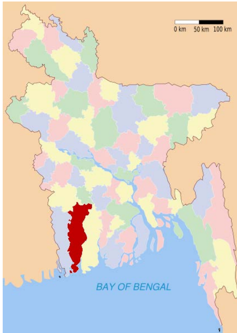
Figure 1: Khulna District, Bangladesh

Bangladesh imposed by the IMF and the World Bank encouraged the adoption of export-oriented agricultural policies in the country. As Adnan (2013, 105-16) traces, throughout the 1980s, major international banks and development agencies began to fund and promote commercial shrimp production in Bangladesh, addressing rising international demand by strengthening supply chains linking Bangladesh to markets throughout the world.