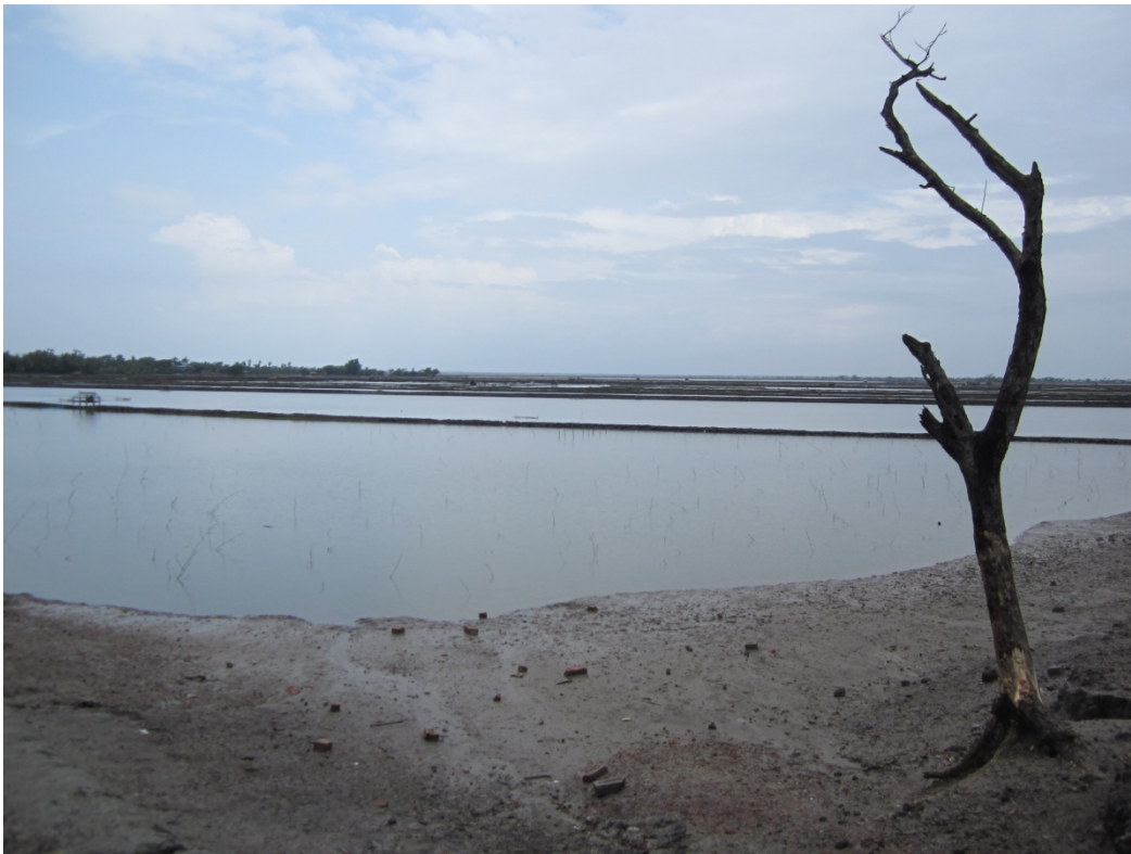
Figure 3: Views from inside Polder 23