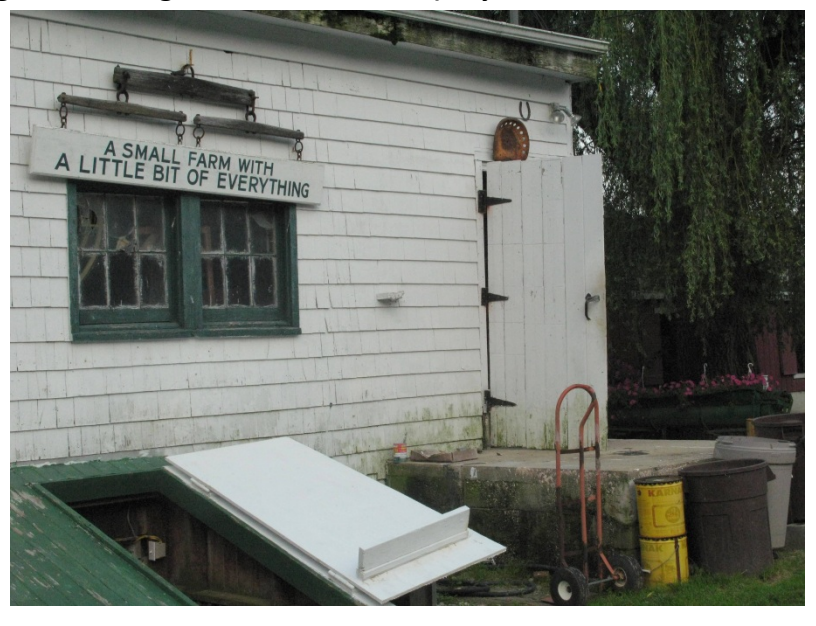
Figure 3: "Imagine a small farm..." (Noyack, New York, USA, 2009)